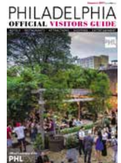
Official Visitors Guide