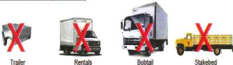
Trailer Rentals Bobtail Stakebed

Use your own power tools and ladders (up to 6 feet) to set up and tear down exhibits.